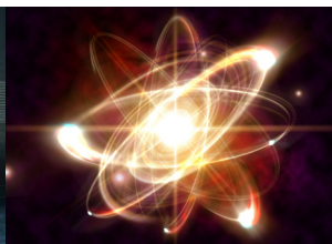
Energy & Environment