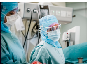
Health & Life Sciences